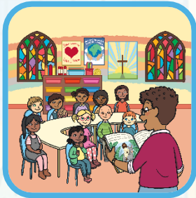
Read or listen to The Easter Story

There are many ways Christian people celebrate Easter. These are just a few Easter traditions .