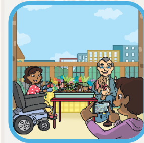
Make an Easter garden