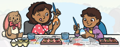
Decorate Easter eggs