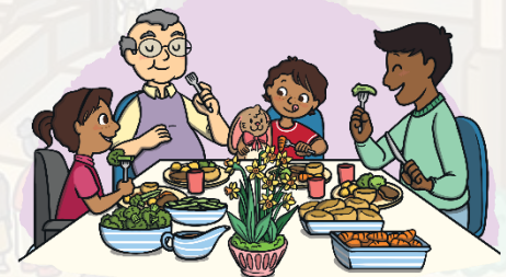
Eat a special dinner