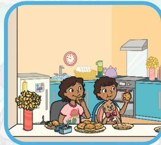
Eat hot cross buns