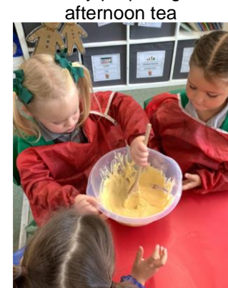
Some morning work in Skylark class relating to their English story