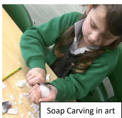
Soap Carving in art