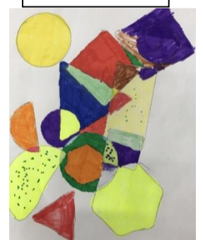
Art inspired by Kandinsky