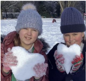
Fun in the snow

Click here to view what our children have been up to recently.