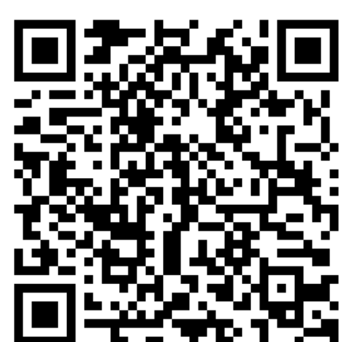
Lower Heath Facebook page Please like and share our posts

We will continue to share the Christmas story and the importance of this to the Christian faith around the world.