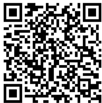
Lower Heath Facebook page Please like and share our posts