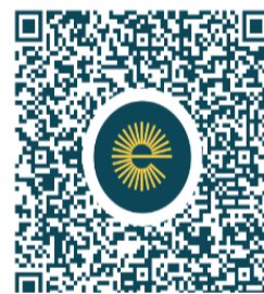
Easyfundraising QR code

Please remember to do any online shopping through the Easyfundraising app. Scan this QR code to set it up. Donations will come to