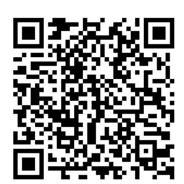
Lower Heath Facebook page Please like and share our posts